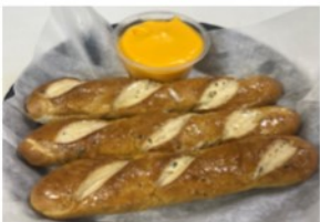
Bavarian Pretzel Breadsticks

Ranch, BBQ, Marinara, Spicy BBQ, Honey Dijon, Tartar, Shrimp Sauce, Hot Sauce, Bleu Cheese, Salsa, Nacho Cheese, French, Italian, KPL Bourbon, Mayo, Sour Cream, French Onion Dip, Thousand Island, Beer Cheese, Parmesan Garlic EXTRA SAUCE $0.75