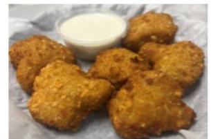
Broccoli Cheddar Bites